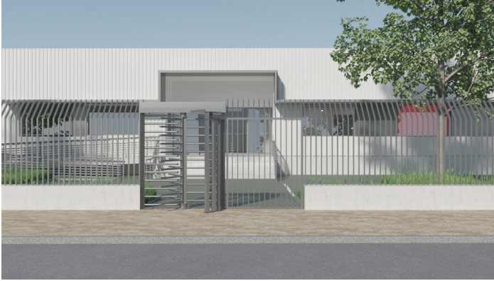
Equinix BX1 IBX data center exterior rendering