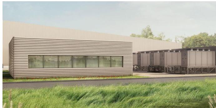
Equinix BX1 IBX data center exterior rendering

Equinix's BX1 site provides approximately 32,300 square feet (3,000 square meters) of colocation space. Powered by 100% renewable energy, this premium facility offers scalable technical space and fully redundant power supplies to deliver leading operational resiliency and world-class security.