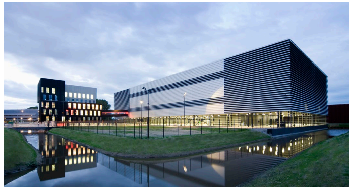
Equinix AM3 IBX data center exterior

The Equinix Amsterdam metro International Business Exchange™ (IBX™) data centers consist of nine buildings with approximately 500,000 square feet (46,475 square meters) of colocation space. The data centers have been awarded the EU Code of Conduct for Energy Efficiency and certified for ISO 50001 (energy management), ensuring our clients' deployments are more energy efficient.