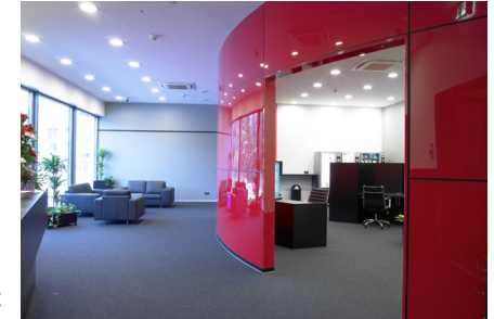
Equinix FR2 IBX reception area