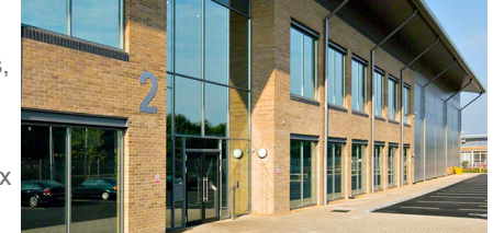
Equinix LD4 IBX exterior