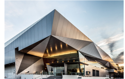
Equinix ME1 IBX exterior