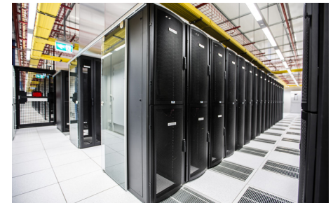
Equinix ME1 IBX colocation