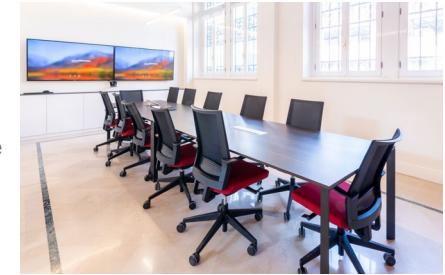
Equinix Milan IBX data center