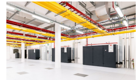
Equinix Milan IBX data center*