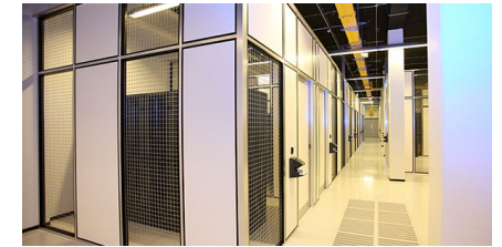
Equinix PA2 IBX colocation