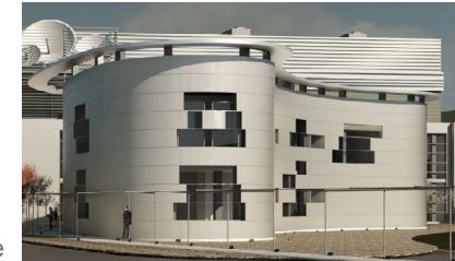
Equinix SP3 IBX data center exterior