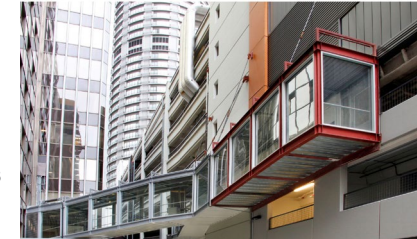
Equinix SE3 IBX data center exterior