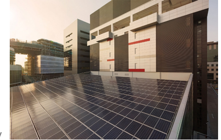
Equinix SG3 Exterior