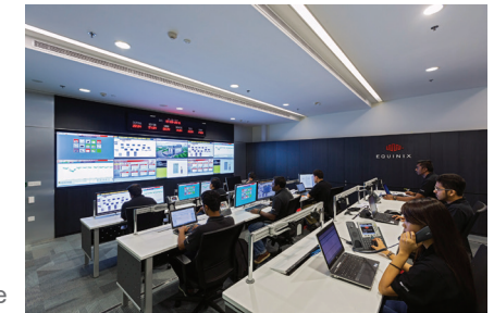
Equinix SG3 Interior