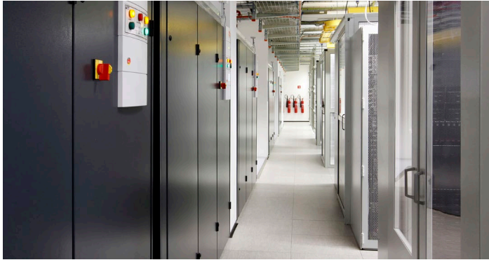
Equinix SO1 IBX data center interior