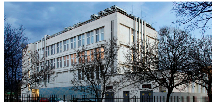
Equinix SO1 IBX data center exterior

The Sofia IBX data center offer 23,000+ square feet (2,150+ square meters) of scalable colocation space, featuring fully redundant power supplies to ensure operational resiliency and world-class security. This is all in close proximity to the city's established business districts.