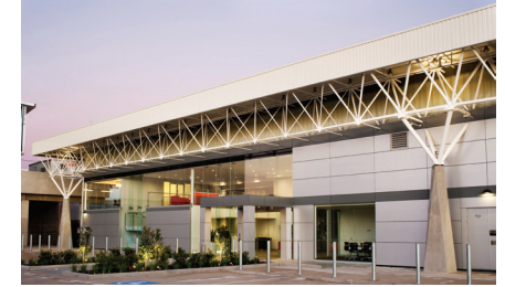
Equinix SY3 IBX exterior