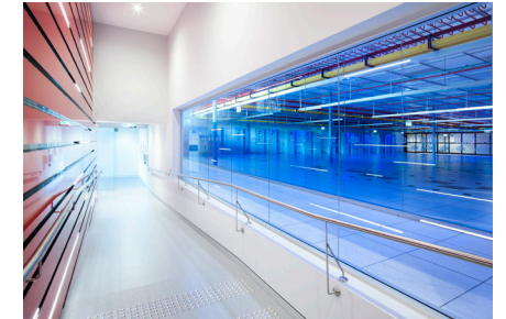
Equinix SY3 IBX mantrap