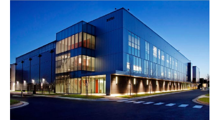
Equinix DC11 IBX data center exterior